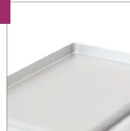
Traytablett-Träger für zwei Standard Trays

Prophy 900 features a large table top on which are inserted two tool trays, 175x280x15 mm, removable and autoclavable in order to ensure maximum hygiene, which is absolutely necessary for surgery.