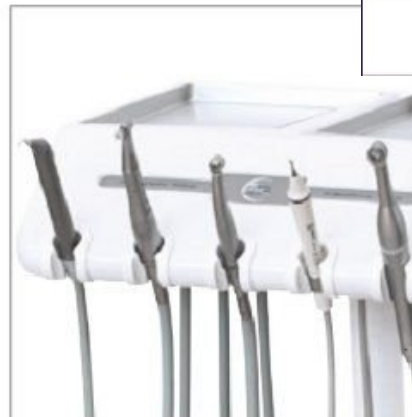
Grundausstattung mit vier instrumentenlinien und einer 3-Funktions-spritze Wasser, Luft, Spray Thanks to the 5 compartments of the instrument table, Prophy 900 can be set up with the most suitable equipment for every need.