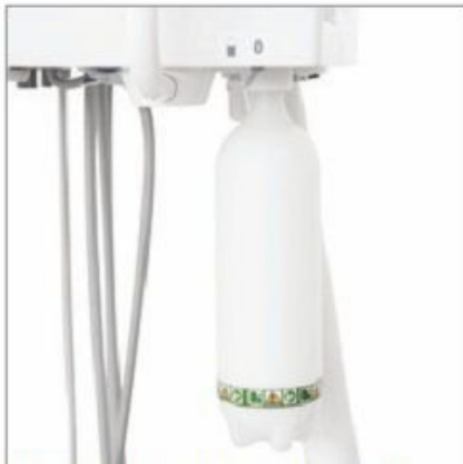
Autonome, hygienische Spraywasserversorgung. Auf Wunsch zweites Flaschensystem für Medikamente Kein Aufpumpen mehr. Wasserversorgung entspricht der Trinkwasserverordnung The separate water supply guarantees total operating autonomy; there is also an independent spray adjustment for each instrument.